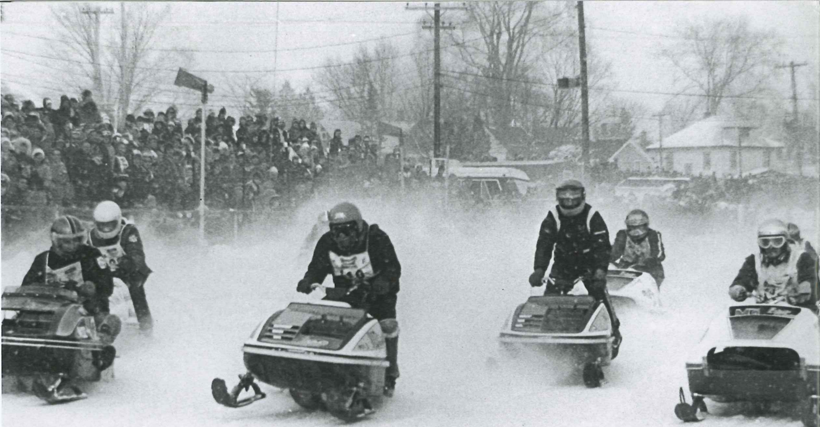
Racers at full speed during an event at Boonville in the early years.